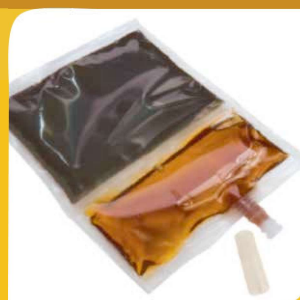
Integrated delivery system. Included nozzle accessory used for LVI-3 series