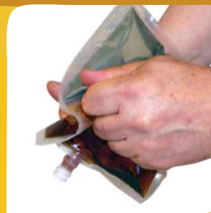
Internal mixing is safe and clean