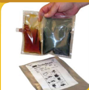
Sealed, two part resin bag

The 3M™ Scotchcast™ Closed Mix-Pour resin system allows mixing and pouring of the two-part resin without exposure to the user. Further, no tools or mixing containers are required.