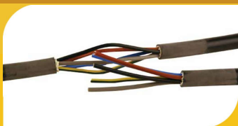
Prepare and connect cables

The 3M™ Scotchcast™ “Express” one-part mould body is now available in inline, T-branch and Y-branch (pictured) configurations.