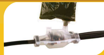
Mix and pour resin