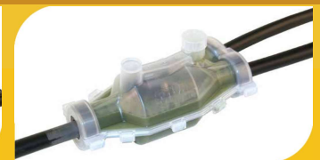
Joint complete when resin has completely filled the mould