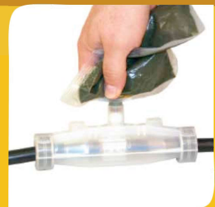
Resin is released and safely poured in one easy step